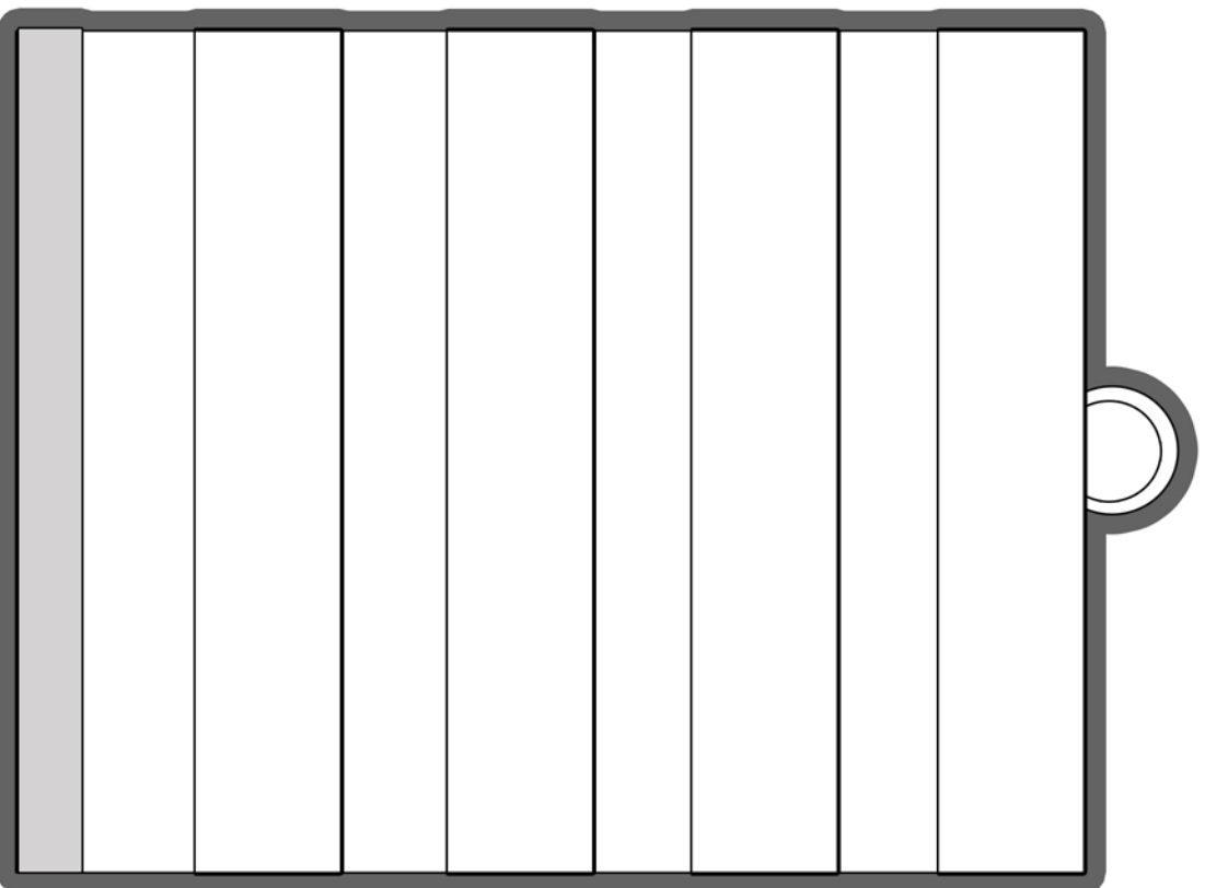
Curved Treasure Chest Top